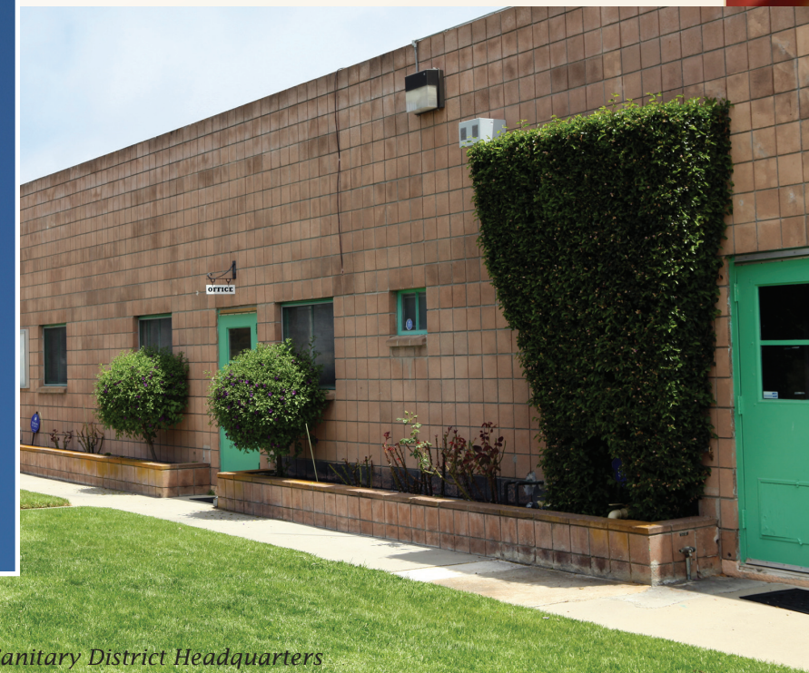
Goleta West Sanitary District Headquarters