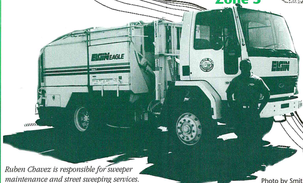
Ruben Chavez is responsible for sweeper maintenance and street sweeping services.