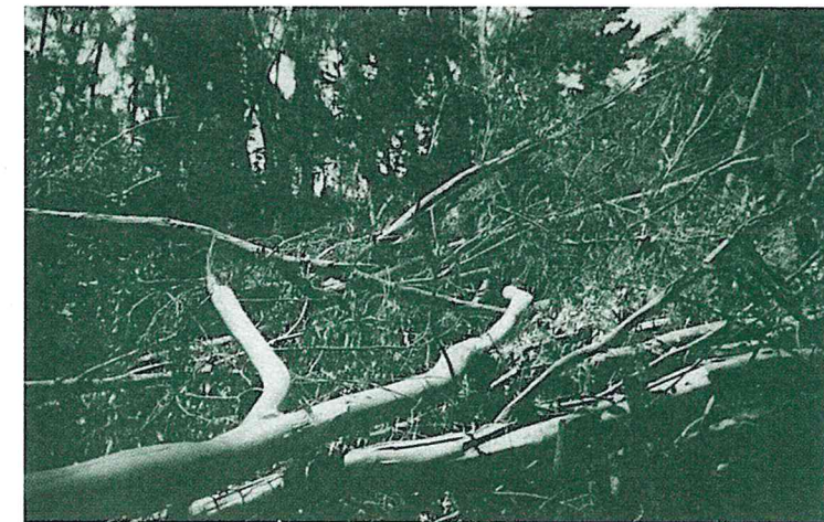
View of District easement in the grove between Coronado and Newport Drives.

Drives. The removals are needed to permit GWSD to maintain access to sewer lines along the 15-foot wide easement running from Hollister Avenue to Devereaux Creek. The removals will also reduce obstructions to public access