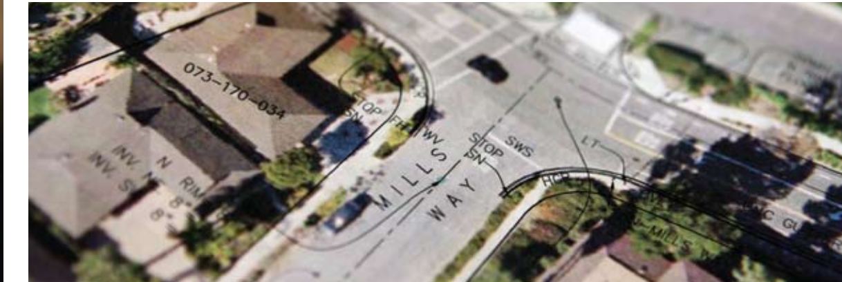
Aerial photo showing pipelines