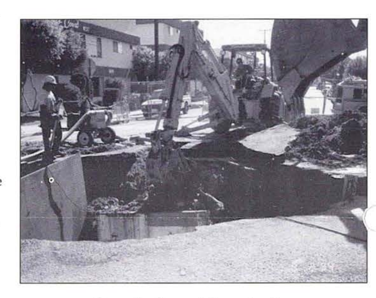
Excavation for manhole construction.

that what goes down the drain will finds its way through a collection system without blockages.