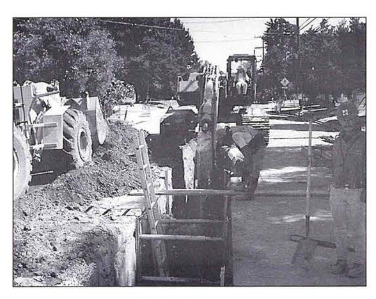
Digging the trench.