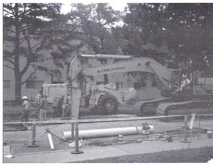
A section of pipe about to be installed.