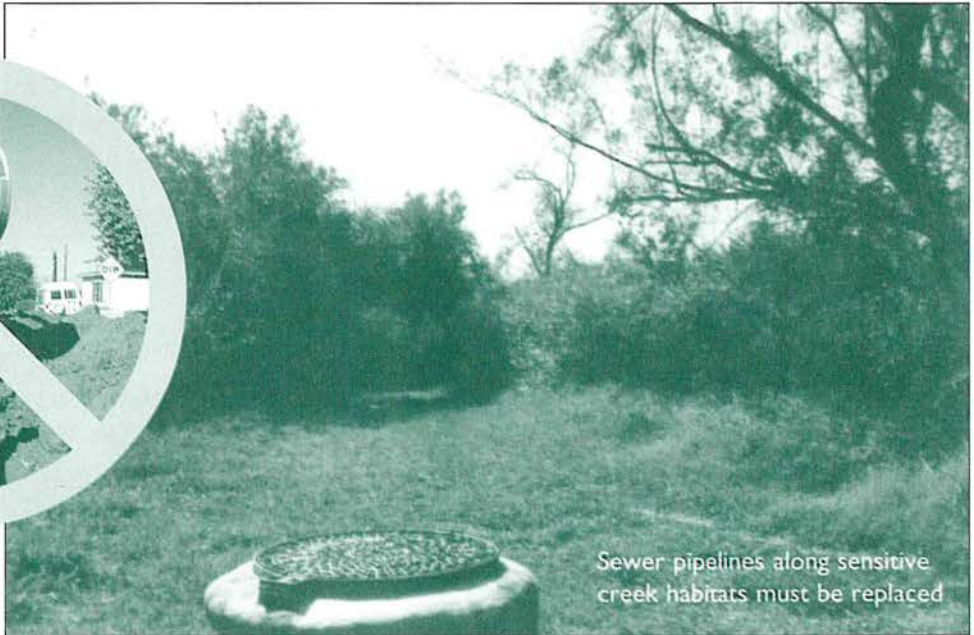
Sewer pipelines along sensitive creek habitats must be replaced